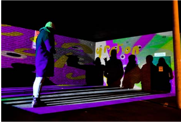
( Gertrude Street Festival - Yarra Youth Services )

Little Projectors Company's Creative Advocacy Program supports individuals and groups to share their voices, ideas and unique experiences through the medium of public and community-based projection and sound. Our programs are unique because the participants are empowered to see their work presented in public space through our mobile projection tools such as Projector Bike , Back Story and Cinema .