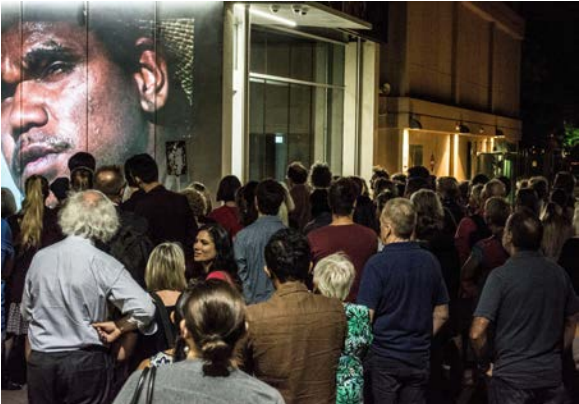
(Enlighten Festival - Bendigo)