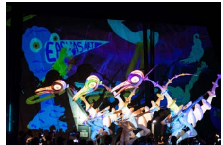
(White Night - Melbourne Museum)