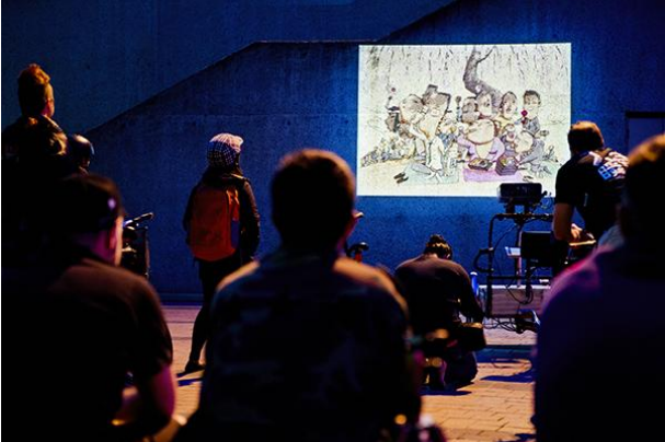
(Friday Night Rides - Testing Grounds)