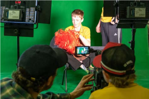
(Ariah Light Festival - Ariah Park High School)