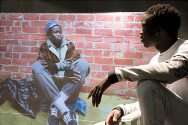
(The Wheels of Fate - Uprising Theater)