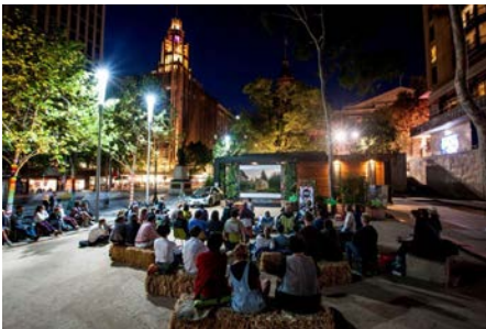
(Transitions Film Festival)