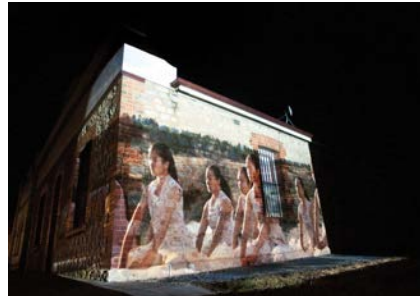
(Regional Arts Victoria)