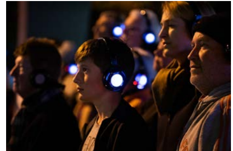
(Williamstown Walking Tour)